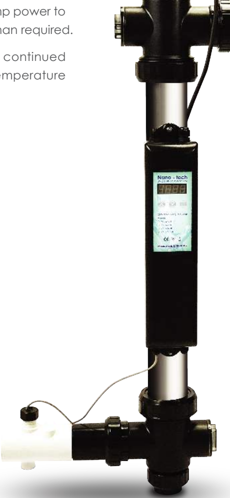
Note : 'F" stands for Flowswitch, "T" stands for Timer