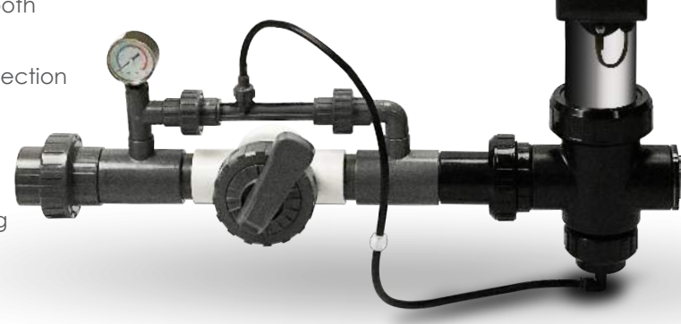
Note: 'O" stands for Ozone, "T" stands for Timer