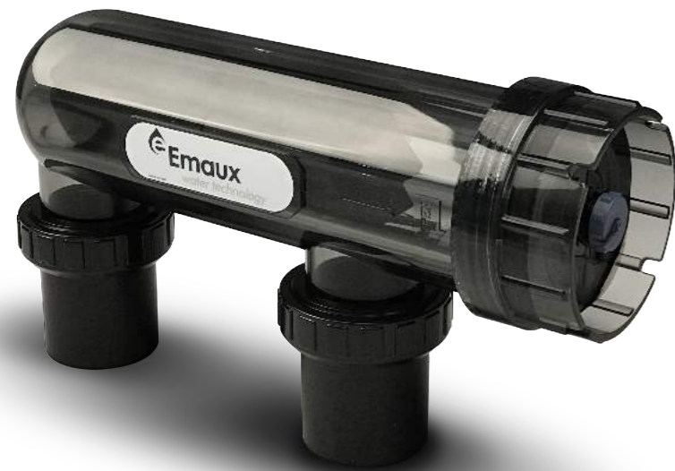
Titanium cell with 2 meters cable