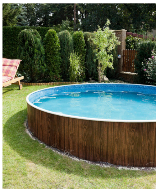
Aqua-Mini Pump is designed for above ground pools