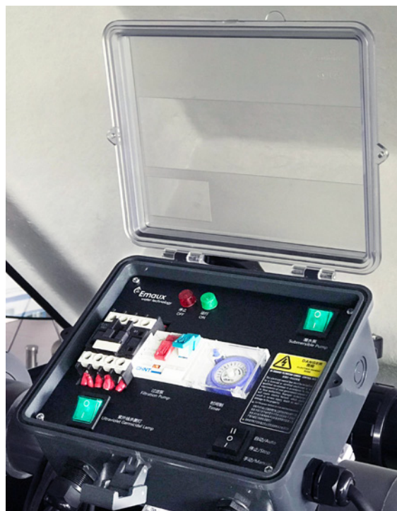
Simplify control on one panel